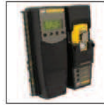
MicroDock II compatible