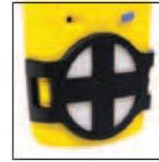
Auxiliary Filter Kit