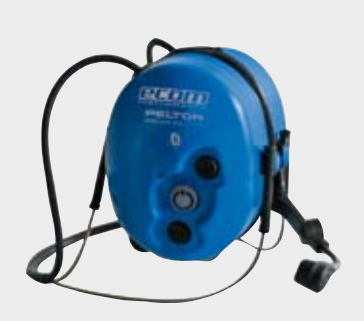
Ear protection headset MT53H7BWS2-EC Neckband