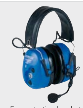
Ear protection headset MT53H7AWS2-EC Headband