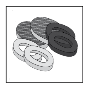
Hygiene set HY79