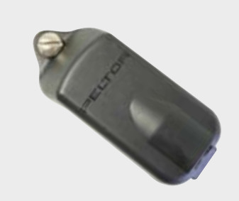
Spare battery pack ACKI5-EC