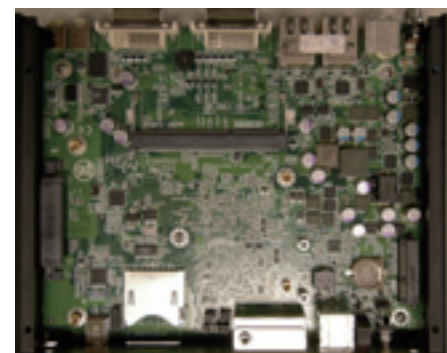
» Fanless Design