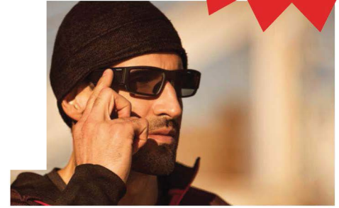
Receive work instructions on the job