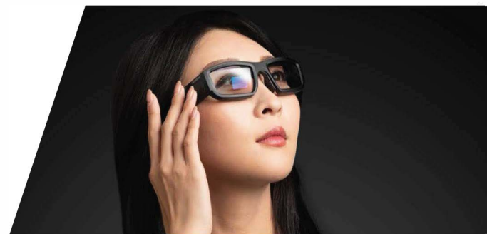
Operate the Vuzix Blade with your voice or the built-in touchpad for silent control

The Vuzix Blade are the first Augmented Reality (AR) Smart Glasses featuring advanced waveguide optics for hands-free mobile computing & connectivity.