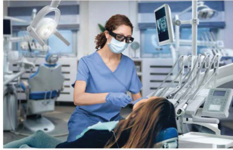
Real-time, hands-free information