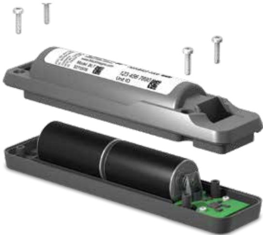
Easy Loners Beacon Battery Replacement