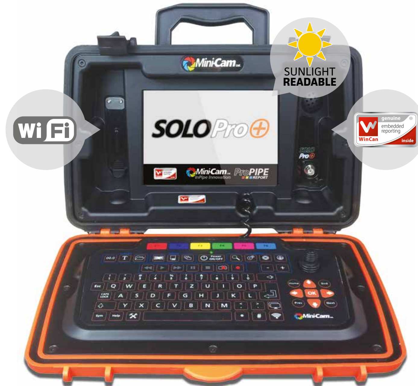
SOLOPro+ Control Unit CCU210

Use the SOLOPro+ control unit to view, record and annotate inspection footage from any composite video source