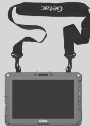
Attaching to the Tablet