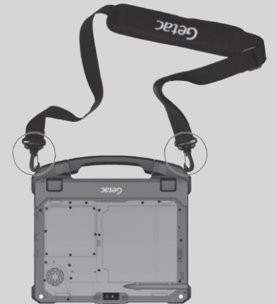
Attaching to the Detachable Keyboard