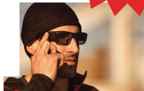
Receive work instructions on the job