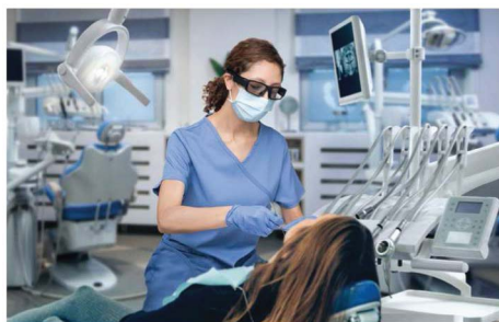
Real-time, hands-free information